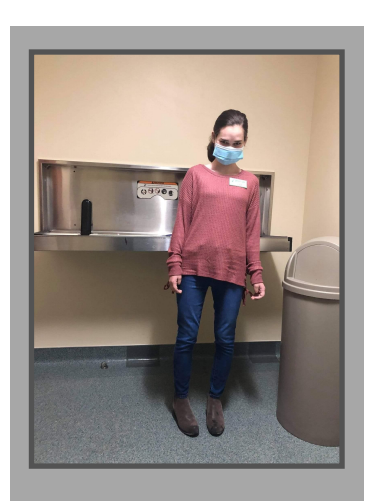
This fixed-height table is too high to climb onto, and it is very hard for caregivers to lift adult loved ones.

State fairgrounds Hospitals and medical offices Water parks, public pools Amusement Parks Science centers Movie theaters Tourist Attractions